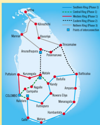
Nation wide fibre optical backbone network to meet broadband requirements of the country.