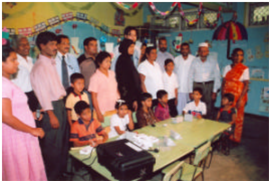
Senkadagala School for the Deaf & Blind, Dodamwela