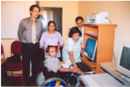
Rehab Lanka Vocational Training Center Maligawatta