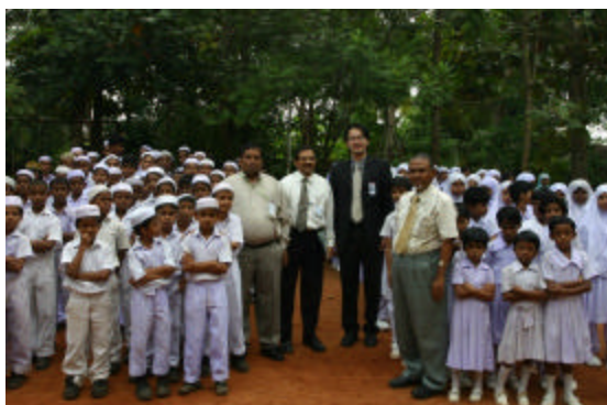
ITU representative visited the Islamic Centre for the Disable Doolmale

evaluation. The ITU assistance included provision of equipment i.e. computers and ICT devices, as well as special equipment for people with disabilities, in amount of Rupees 3,534,100 or approximate US$ 32,128.