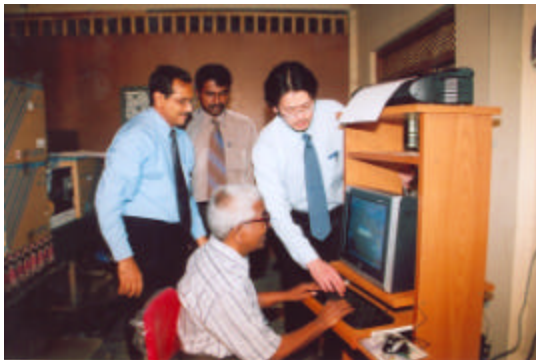
School for the Blind, Pollonmaruwa