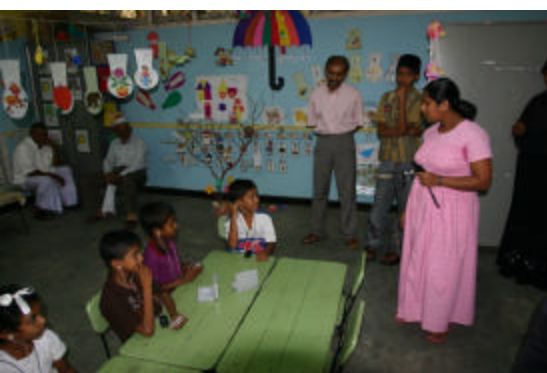
Provided FM group hearing system for teacher & students with hearing impairment