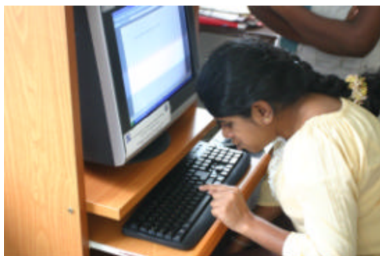
ICT facilities provided to students with mental problems