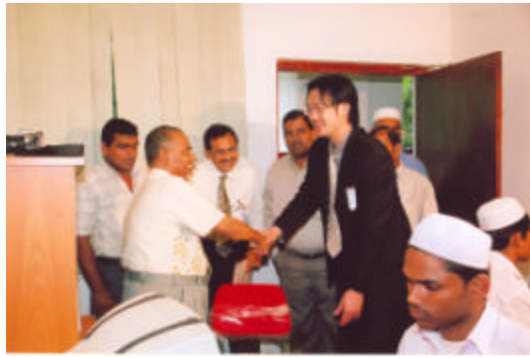
Islamic Centre for the Disabled Doolmale, Thihariya