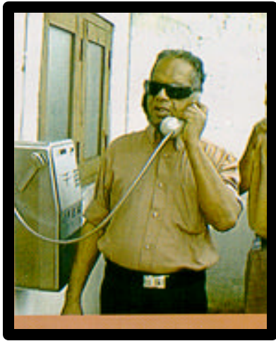
Payphone – Council for the Blind