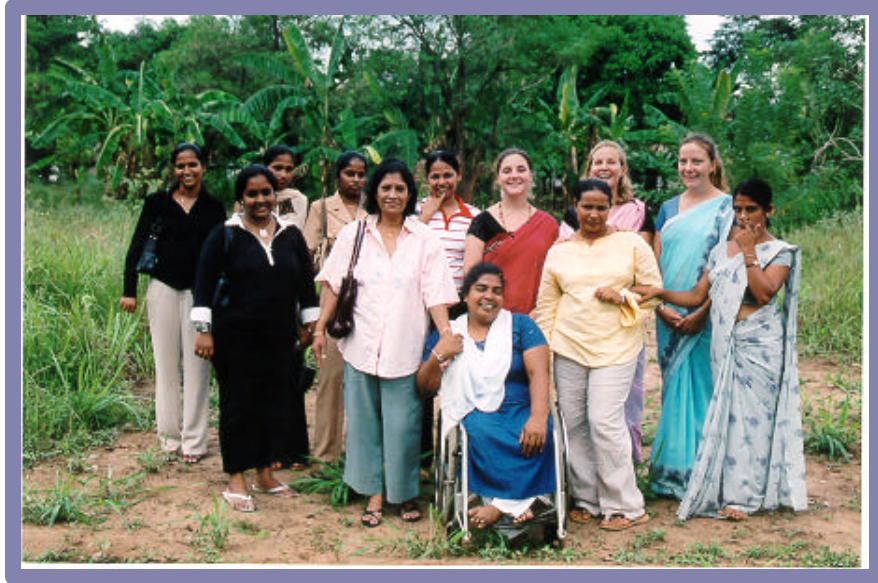
Women helping in the empowerment of other Women