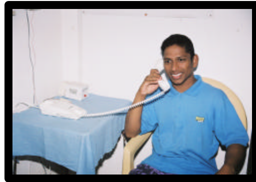
Telephone with assistive technology for hearing impaired students.